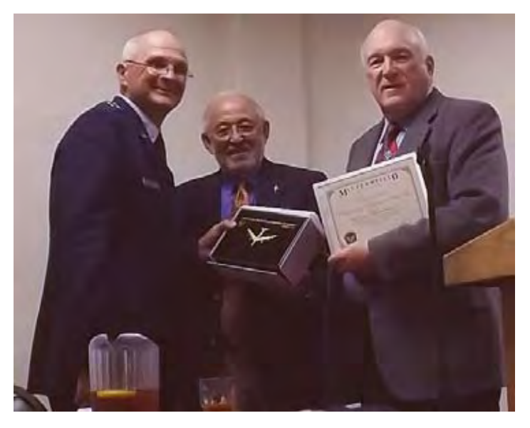
General Bunch receives recognition from the Museum (above).

There were over 60 people in attendance at the banquet (below)