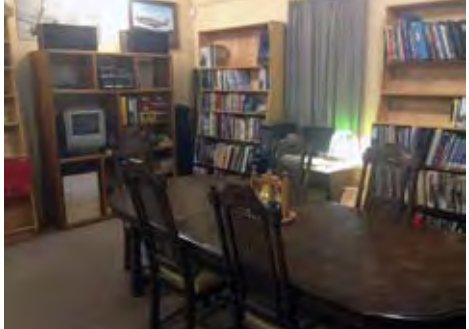
Before (top) and After (bottom)

If you would be interested in assisting in this project, the museum staff would welcome your help. Please contact the museum at (661) 393-0291, or Daryl Curtis at (661) 345-7733.