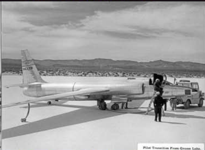
Pilot Transition From Groom Lake.