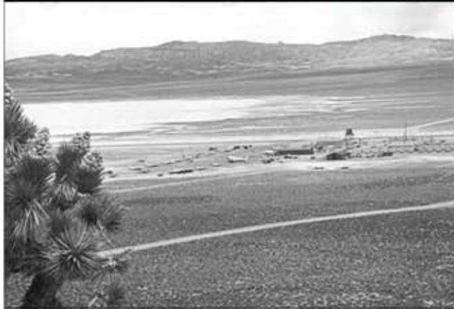
Area 51 at Groom Lake taken in the 1950's.

For years, the rumors of a secret test sight in the Nevada desert have floated around, especially since the U-2 and SR-71 spyplanes were tested, and later the F-117 Stealth Fighter. Well, now is your chance to learn all about Area 51 and the planes that were tested there at the "Area 51 & SR-71" event to be held at the Museum hangar on Saturday, April 20, 2013.