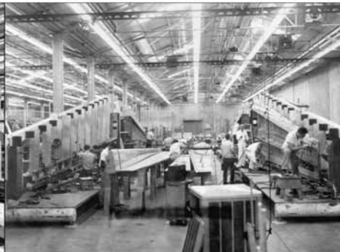
Interior shots of fuselage - and wings being assembled