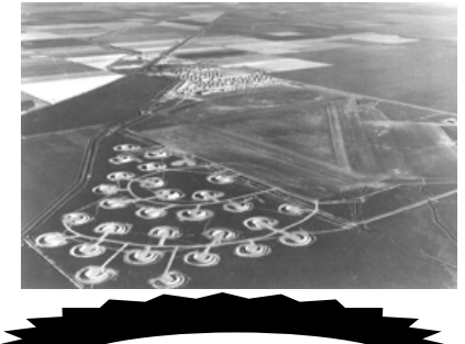
We're on the Web