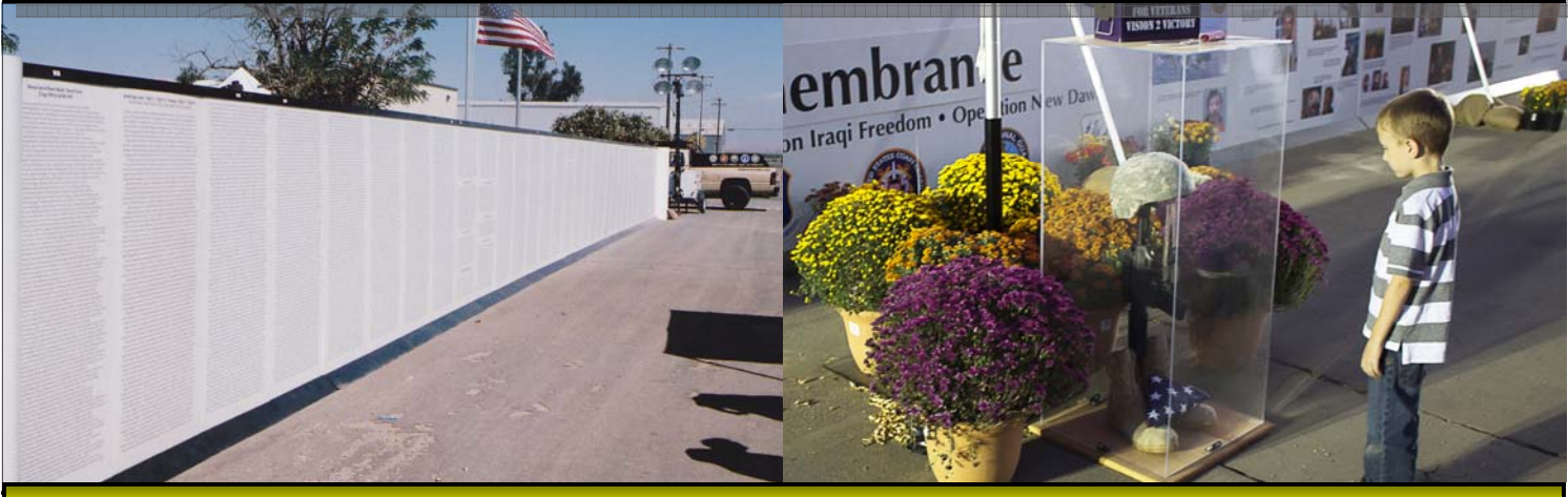
Wall of Remembrance - 9,000 Names—Global Wall of Terror