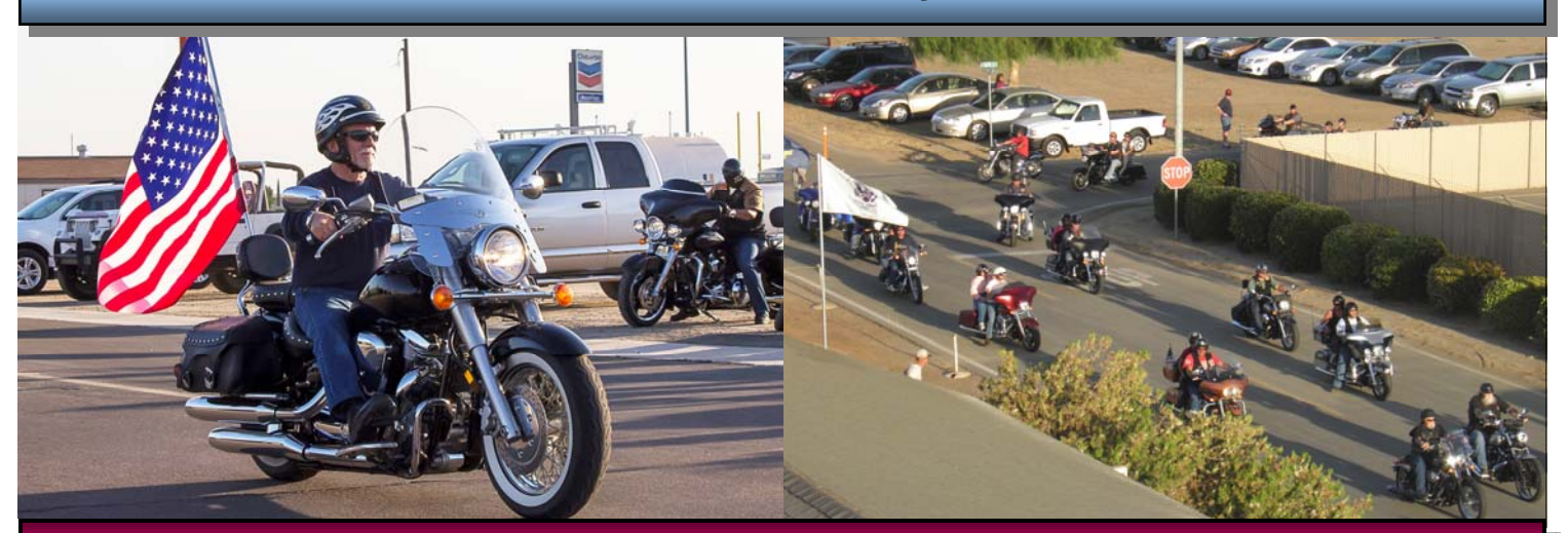
300+ Cycles Motor to Minter