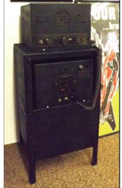
Minter Tower Radio