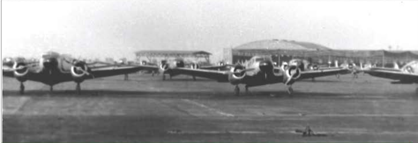
Tarmac Was Full of Bamboo Bombers