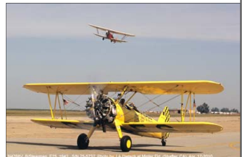
14788V 5/Steamer: ETS, 1942. SN 75-5737. Photo by J.A. Detsch at Minter Fld. (Shutter: CAL/Asst: 17-2010)

For more information, visit our website at www.MinterFieldAirMuseum.com .