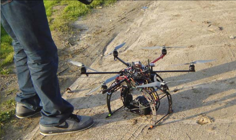
Museum Provides Jeeps & Uniforms—Gyro Stabilized Camera Used