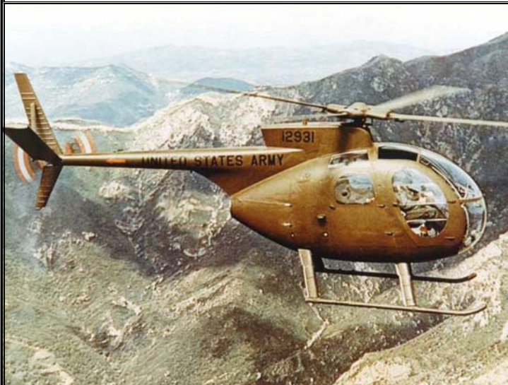
OH-6 Cayuse—Vietnam Era

Our new bird will be renovated and painted in Vietnam colors.