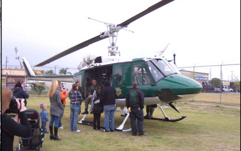
Heavy Iron from Natl Guard