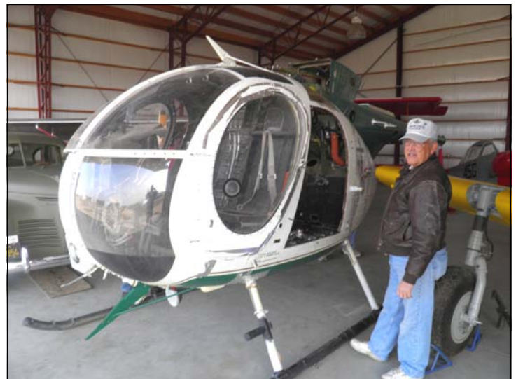
OH-6 "LOACH" Low Altitude Observation