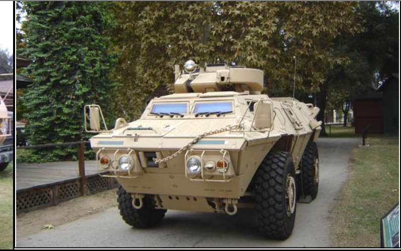
Armored Personnel Carrier