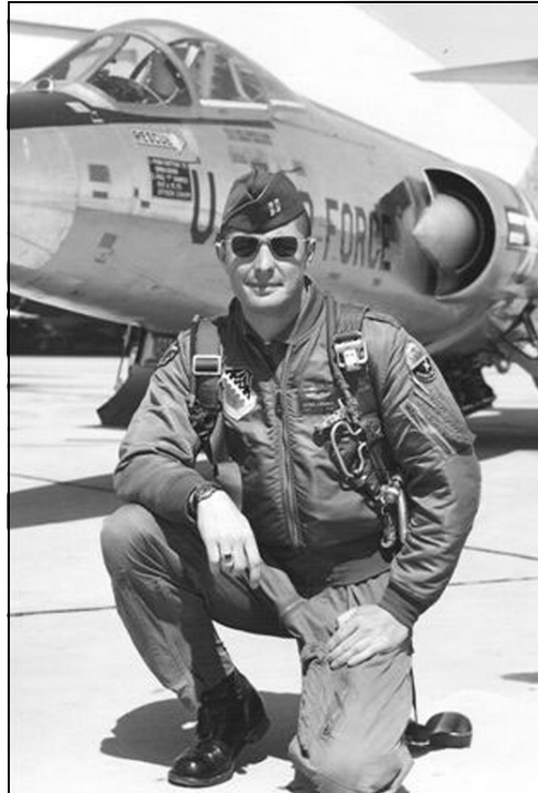
Edwards Test Pilot—1964