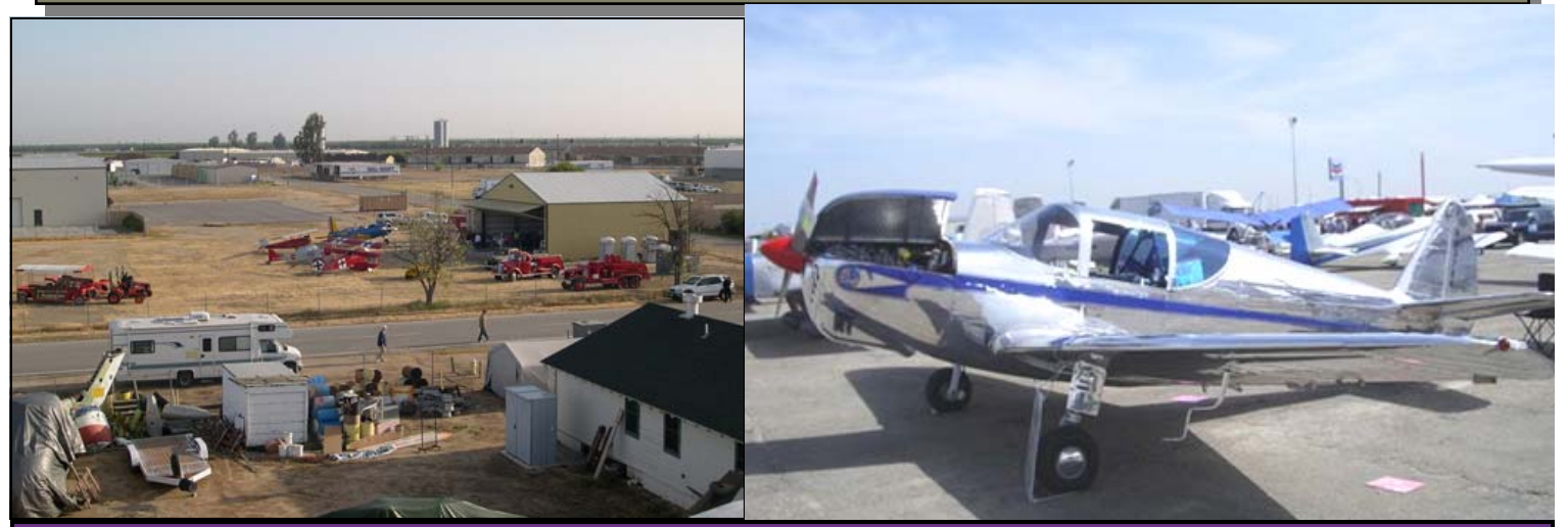
View of Hangar Area from Tower - Beautiful Globe Swift Gleams in Sun