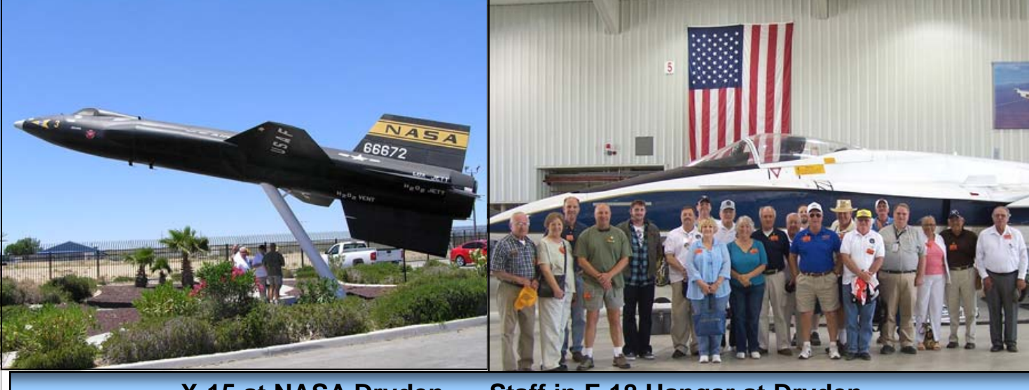
X-15 at NASA Dryden - Staff in F-18 Hangar at Dryden