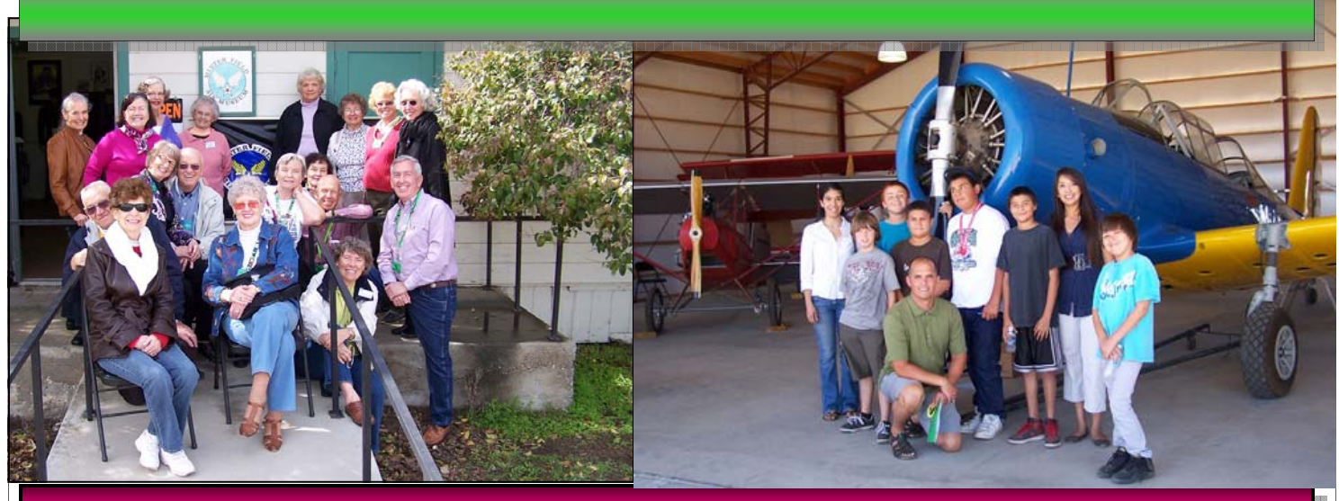
Friendship Force Visits Museum - Shafter Boot Camp Sees Hangar Aircraft