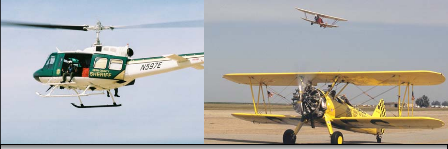
Kern Co Sheriff's Huey - Stearman and New Standard Gave Rides