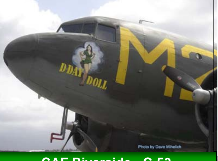
CAF Riverside - C-53