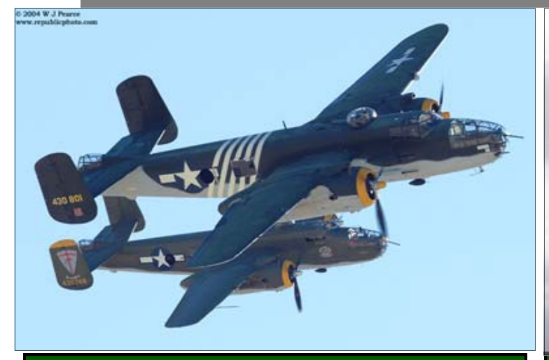
B-25s Executive Sweet & Heavenly Body