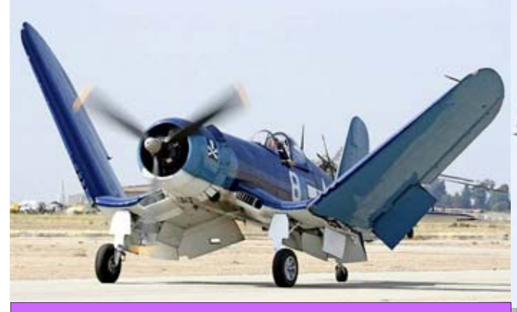
Chuck Wentworth's Corsair Waves Hello