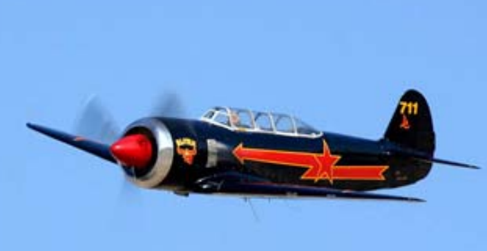
Kent Carlomagno's Yak-11 "Blyak Moose"