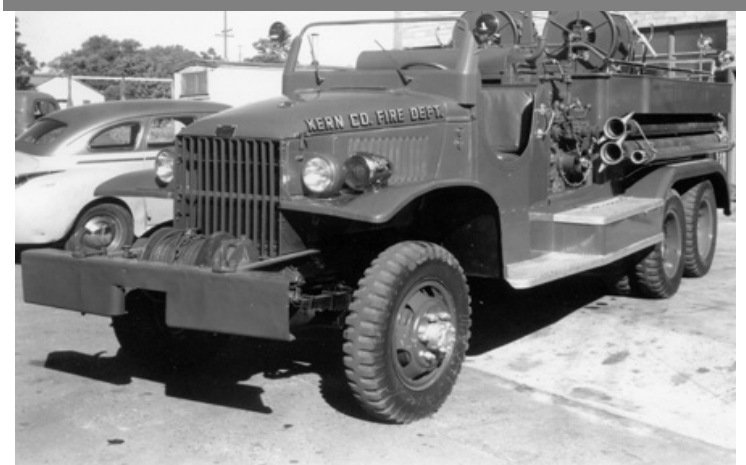
1945 GMC Fire Truck Then — and — Now —Back on it's