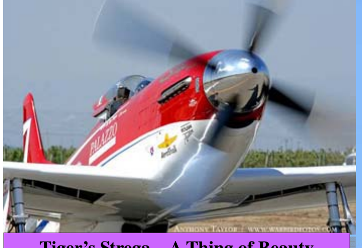
Tiger's Strega—A Thing of Beauty