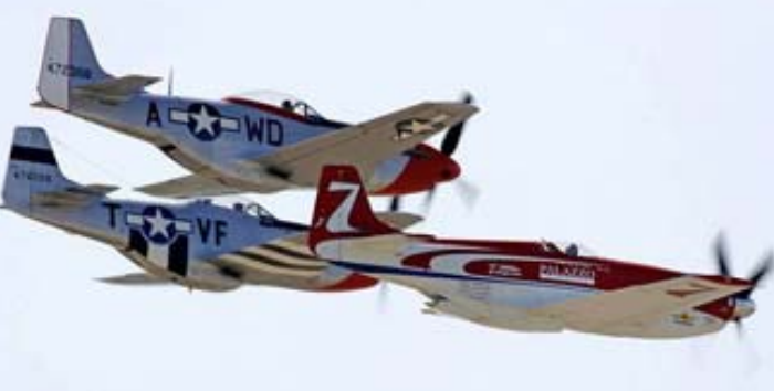
A Gaggle of Mustangs