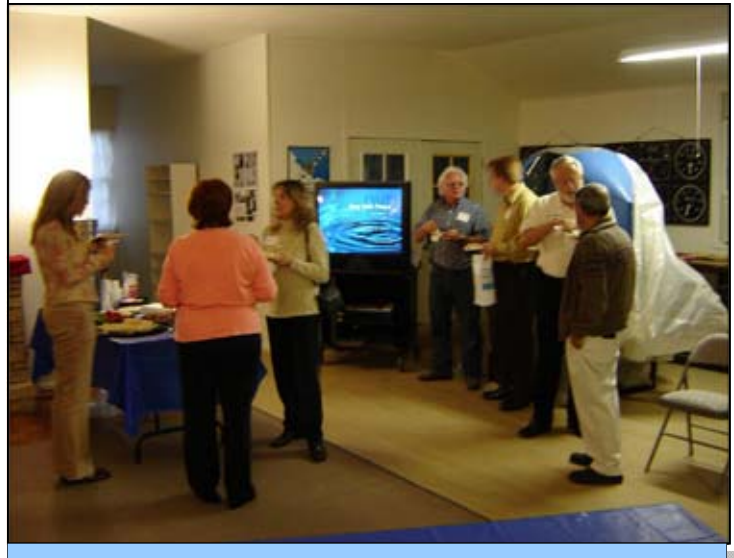
Refreshments served in newly finished Library area.

If your group or organization would like to have a presentation by the Minter Field Air Museum staff, we are developing a video program that we can present at your meeting that gives an overall picture of the history of Minter Field and the Minter Field Air Museum, as well as Warbirds In Action Air Show highlights. To discuss a program, call the Museum at (661) 393-0291 and leave us a message with a phone number and e-mail. We will reply.