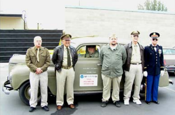
Museum's Follow Me Jeep with Air Show Sign—1940 Plymouth Staff Car—Complete with Staff