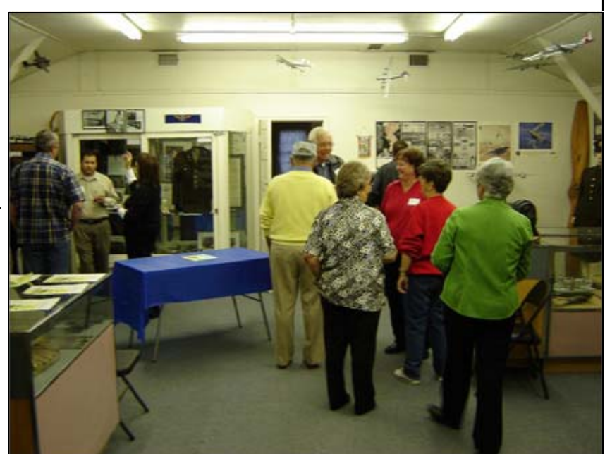
Shafter Chamber browses Museum Displays

Members of the Shafter Business community held a Chamber Mixer at the Museum recently. The afterwork affair gave local business and government officials a chance to see how much has been accomplished at the Museum in the past couple of years. We made a lot of new friends, and we hope to develop a closer relationship.