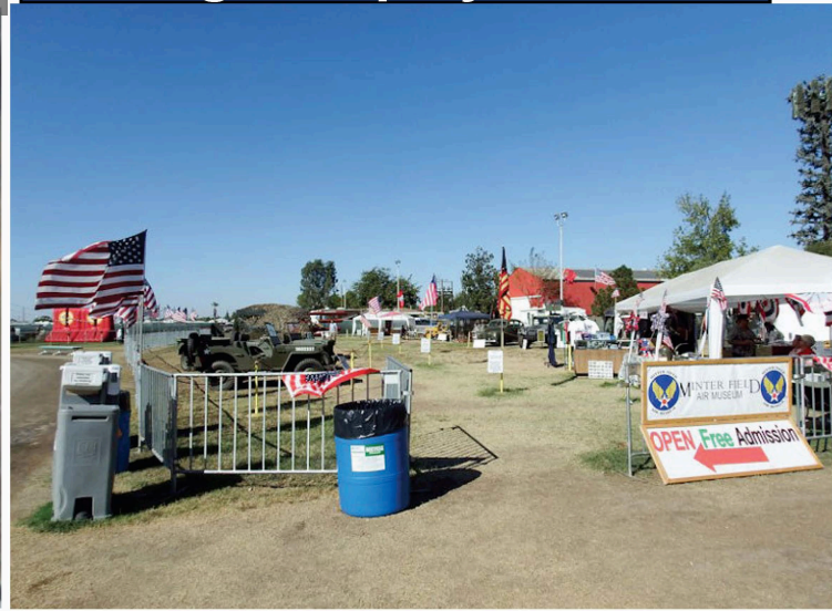
Large Display at Fair