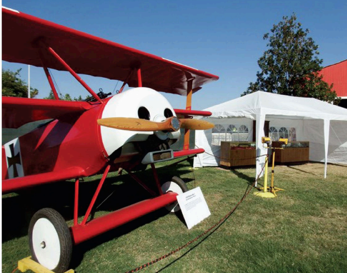
Fokker Triplane at K Co Fair