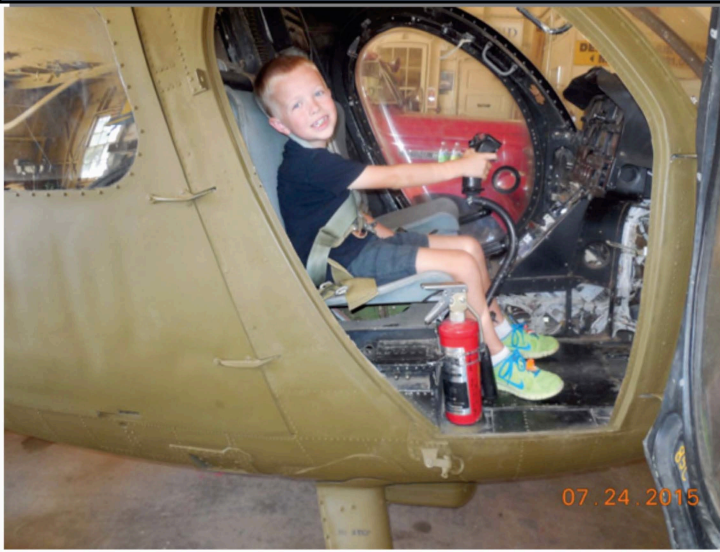
Kids Enjoy Open Cockpit Day