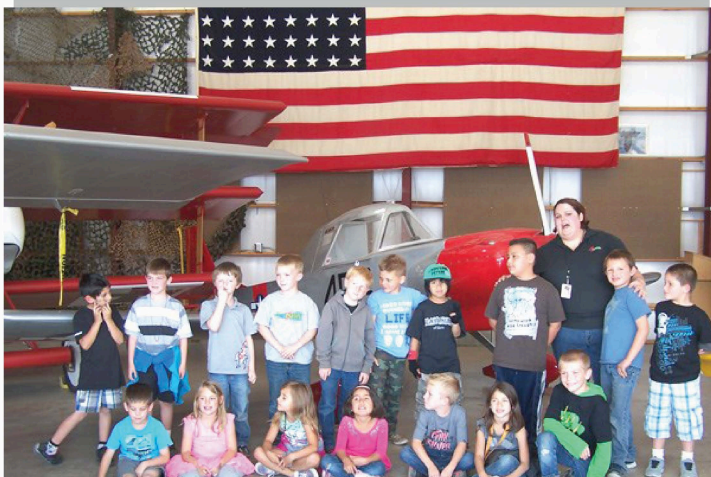
School Tours are Fun for Kids