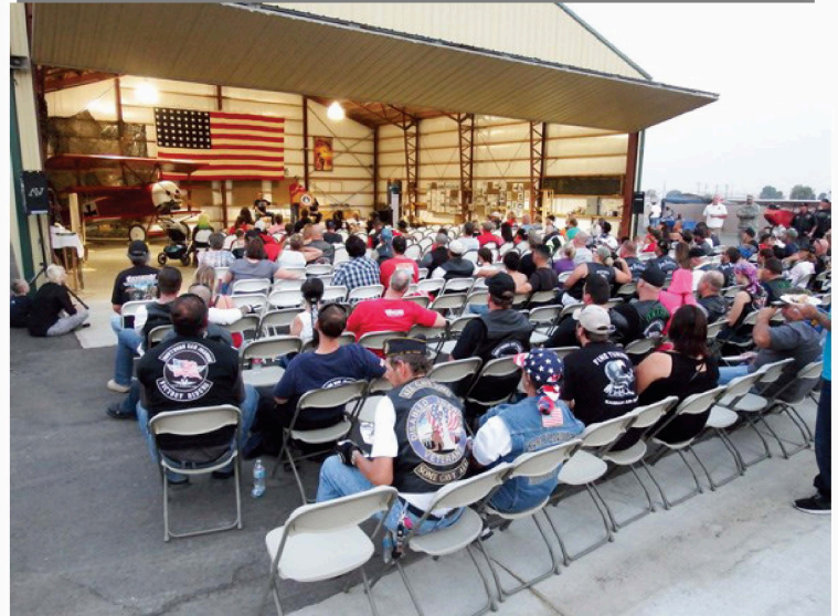
Great Crowd for 9/11 Event