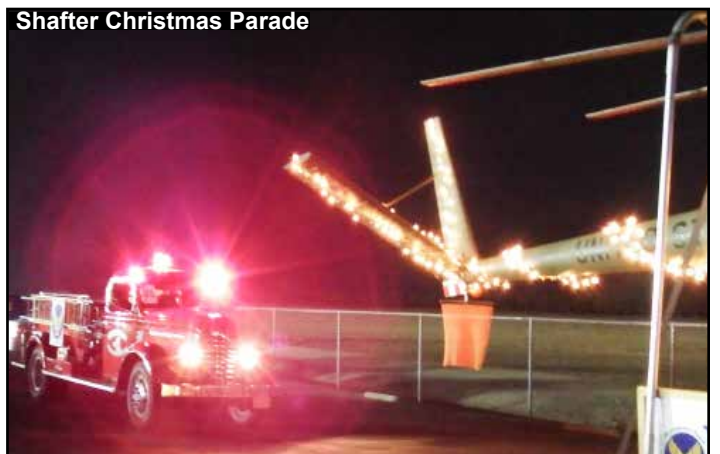
Shafter Christmas Parade