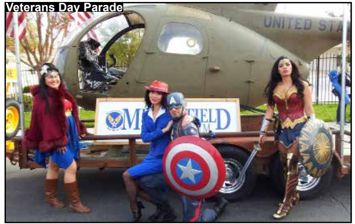
Veterans Day Parade