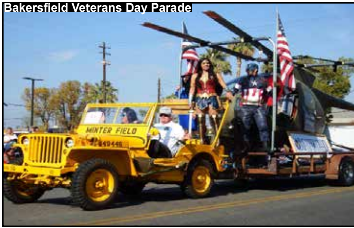
Bakersfield Veterans Day Parade